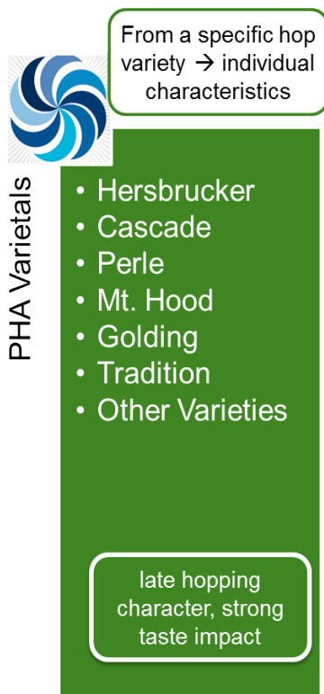
Figure 1: PHA® Varietal

PHA® Varietals are prepared from cone hops by specific extraction and distillation methods. They consist of original hop oil compounds in an aqueous propylene glycol (PG) solution. PG is a permitted carrier for flavours as per regulation 2006/52/EC. PHA® products are exclusively supplied worldwide by BarthHaas.