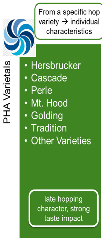
Figure 1: PHA® Varietal

PHA® Varietals are prepared from hops by specific extraction and distillation methods. They consist of original hop oil compounds in an aqueous propylene glycol (PG) solution. PG is a permitted carrier for flavours as per regulation 2006/52/EC. PHA® products are exclusively supplied worldwide by BarthHaas.